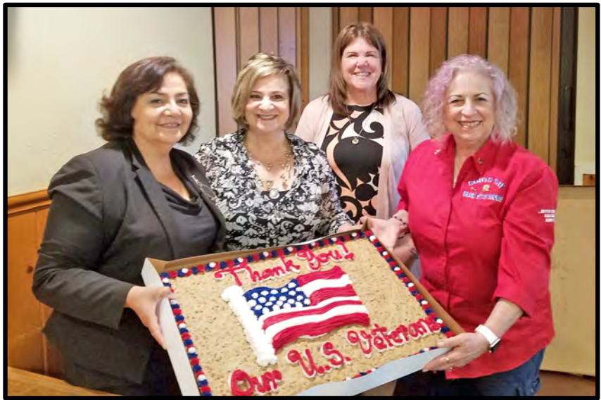
Adopt a Military Mom Gratitude for Chapter 201 Support