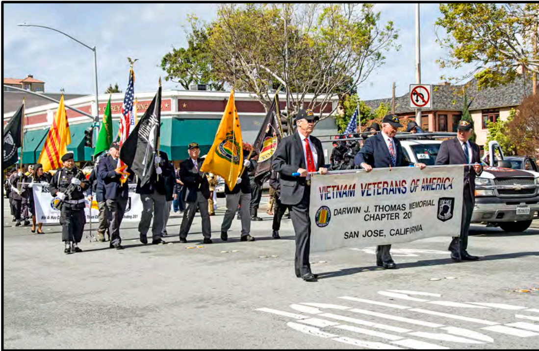
VVA Chapter 201 Color Guard participates in Operation Eagle Visit Parade

Chapter 201 members carried the Chapter 201 banner and provided a color guard along with a large contingent of Chapter 201 VVA Associates.