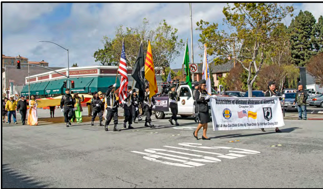
Chapter 201 Associates Color Guard participates in Operation Eagle Visit Parade

Following the parade, the City of San Mateo hosted a “Festival in Central Park” in downtown San Mateo. The family-friendly festival included food trucks, community booths, as well as music, bouncy houses, face painting, a magic show, balloon twister, arts and crafts table and photo booth.