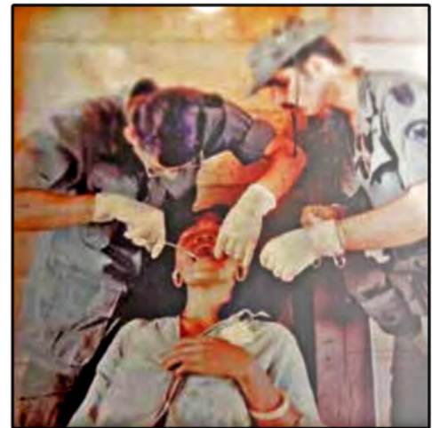
Dental Care for Vietnamese 1969

My unit was mobile, which means we would go where our troops needed medical and dental support. After treating our personnel using doctors, dentist and tech's like me, we would proceed to Vietnamese remote villages to help civilians with their issues. We had security forces to protect us since the enemy hated what we did and would have executed us in a heartbeat. We were winning the hearts and minds of the villagers with food and medicine. Interpreters would let the people know we were there to support and assist them for a better life. Every single person I came in contact with wanted what we had to offer in the States. They called it MEDCAP Missions-Medical Civil Action Patrol. I also saw nation building first hand and have the pictures to prove it. Roads, hospitals, schools, orphanages and infrastructure all provided for a country begging to be free of communism. I witnessed how horrible the communist were to their own people. It made me proud to be in the military and protect and serve those innocent helpless civilians.