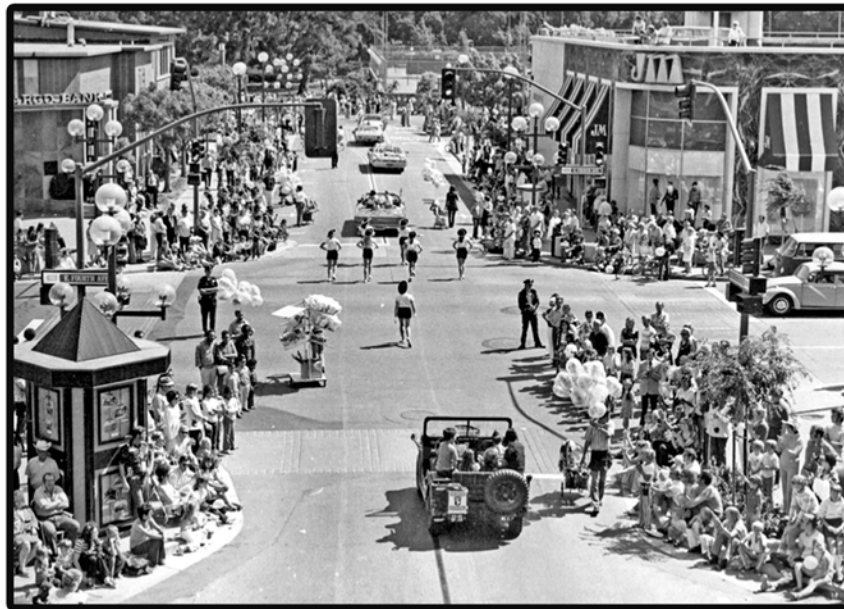
1972 San Mateo Welcome Home Parade

On March 4, 1968, San Mateo City Council voted unanimously to adopt Alpha Company, 1st Battalion, 327th Infantry Regiment, 1st Brigade, 101st Airborne Division of the U.S. Army in hopes of improving morale among the fighting troops during the Vietnam War. Support from the city, and its residents, was so strong that at the end of the Vietnam War, San Mateo held the only homecoming parade in the United States honoring returning Vietnam veterans.